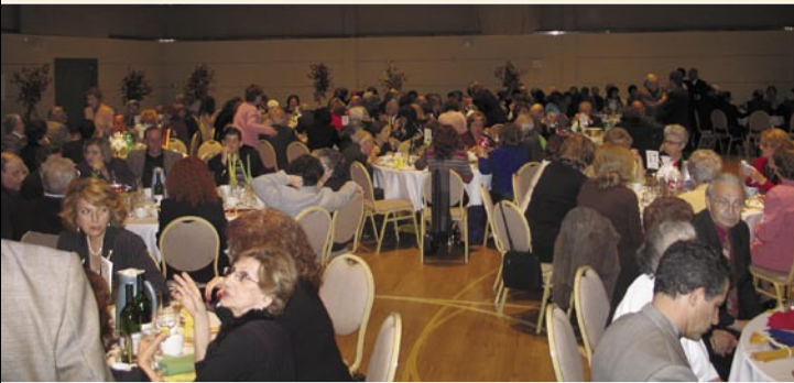
A glimpse from the event

AT THE BRANDVIEW COLLECTION IN GLENDALE, CALIFORNIA.