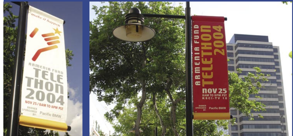
Street light banners line up on Brand Boulevard