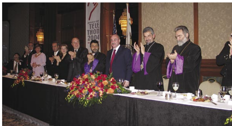
Armenia Fund's 2004 Gala