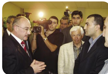
President Ghoukasian during a press conference